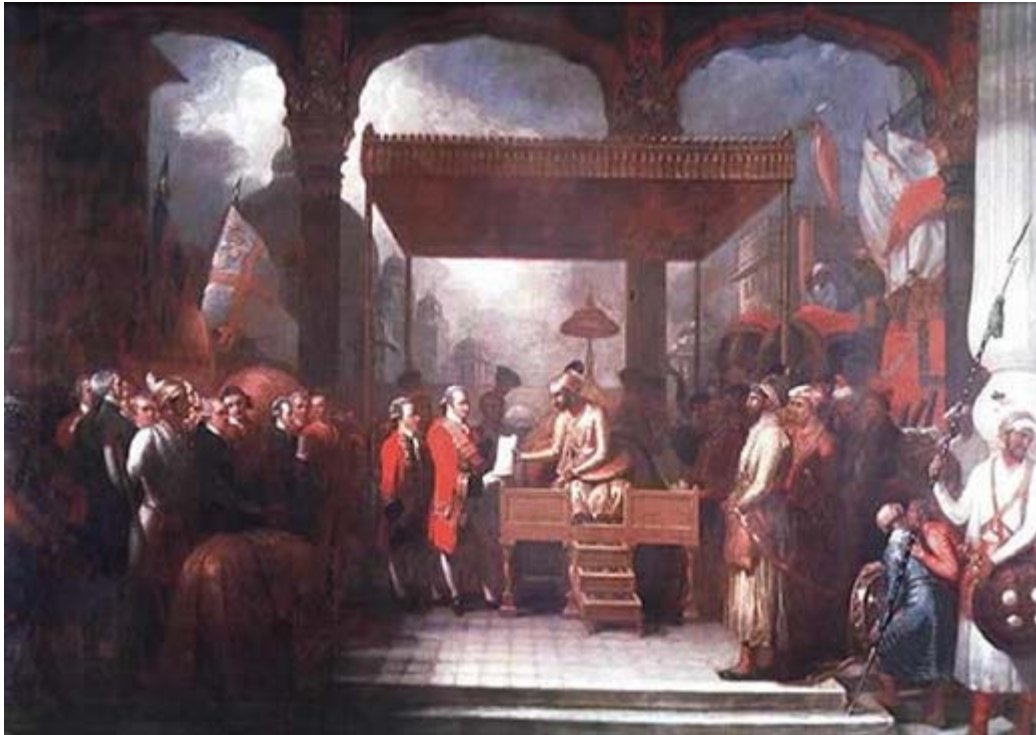
General Clive of the British East India Company gaining the right to collect taxes in Bengal in 1765