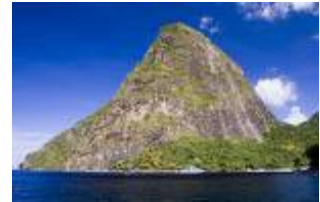
A volcanic island

Others are formed because of the activities of volcanoes under the sea.